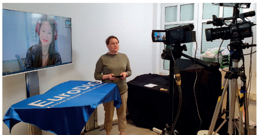
Before and after each session the moderator in Leipzig called live into each studio for a short pre- and post-review.

The security of the virtual environment is key, and it is vital to test all eventualities in advance and have fallback options. We know now that what worked well in one case might fail in another.