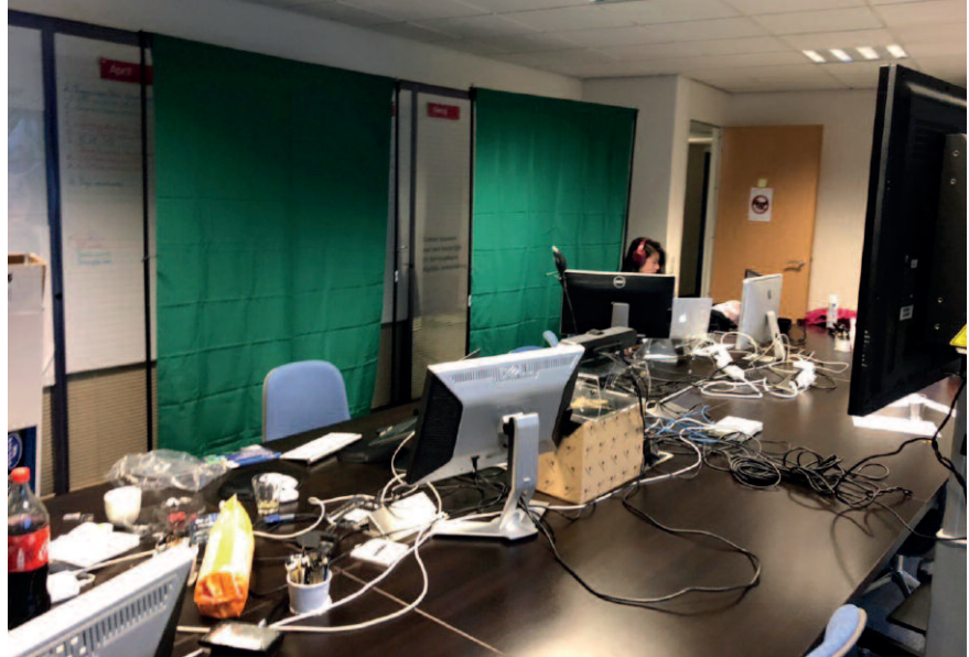
Hosting a studio and running such a complex session can not be simply done from a computer.

Most interventions were made using the Zoom chat, though people could use the “raise hand” function to request the floor.