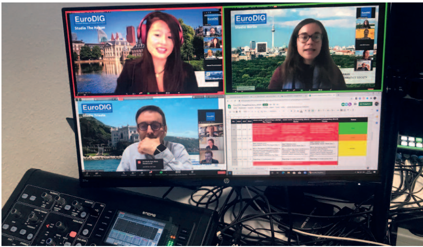
From the headquarters in Leipzig we ran the full technical infrastructure for three sessions in parallel, monitoring operations in all three studios.

Therefore, colleagues in Trieste, The Hague and Berlin established smaller studios and we connected with them. Each studio was responsible for hosting a set of sessions: Studio