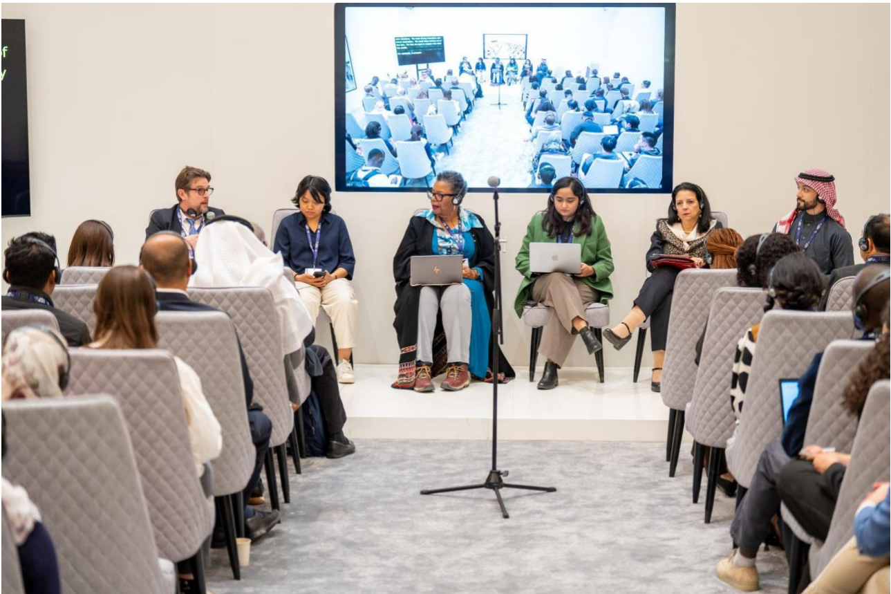
IGF 2024 Global Youth Summit in Riyadh, 8 October